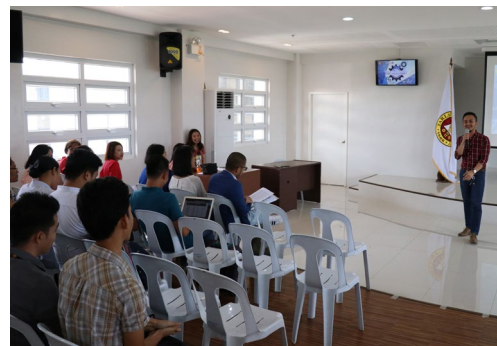
TSU Students Showcase Various Researches at SALIKSIKLABAN 2019