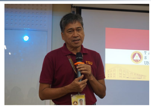
IMS conducts refresher course on document control